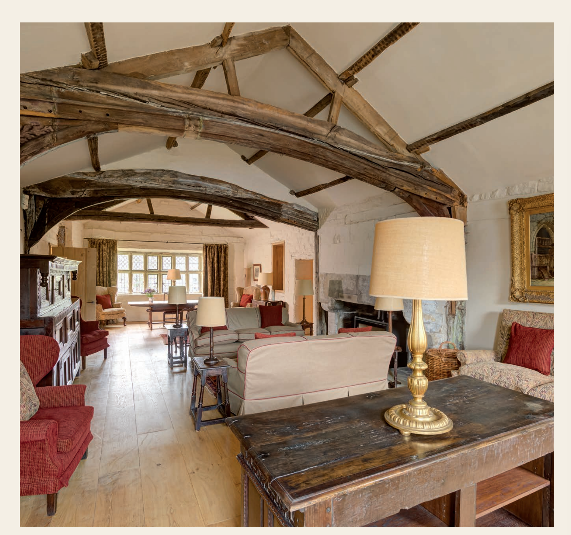
The upper floor of the Solar Block, after repair and conversion.

discovery of an almost complete scheme of mid-16th century paintings, concealed behind lath and plaster walls in one of the cottage bedrooms. They are some of the most significant paintings of their kind, not only in Yorkshire but also nationally. The paintings reflect the wealth and educated status of the Calverley family at the time.