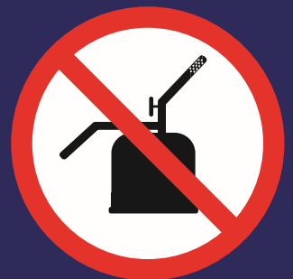
Ignitable gas devices