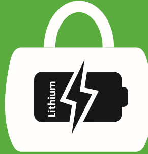
Power banks & spare batteries